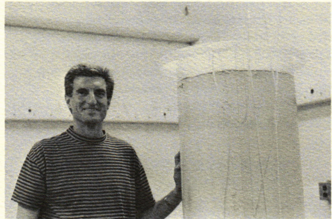
HEDGECOCK WITH MOLLUSCAN CULTURE TANK

With funding support from the USDA's Western Regional Aquaculture Consortium (WRAC) in collaboration with industry and research personnel from the Universities of Oregon and Washington, three sets of eggs were bred with eight sperm types yielding a total of nearly 200 families. Starch gel electrophoresis of biochemical markers, known as allozymes, was used to confirm parentage of all families which are now being